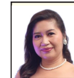
Soci Ame Patagani-Viking Community Service